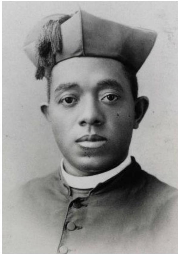
Father Augustus Tolton